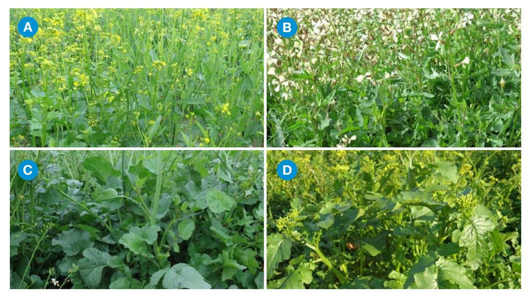
Figure 3. Common biofumigant species investigated for PCN management: A = Brassica juncea (Indian mustard), B = Eruca sativa (rocket), C = Raphanus sativus (oil radish) and D = Sinapis alba (white mustard)

Rocket and oil radish varieties can produce fresh biomass of 30–40 t/ha, with oil radish having the greater biomass potential. White mustard ( Sinapis alba ) often produces high biomass. However, its main glucosinolate is glucosinalbin, which is of limited use for PCN management. Table 1 shows biofumigation efficacy against PCN for published field studies. Further information, including details of seed suppliers, can be obtained from the International Biofumigation Network.