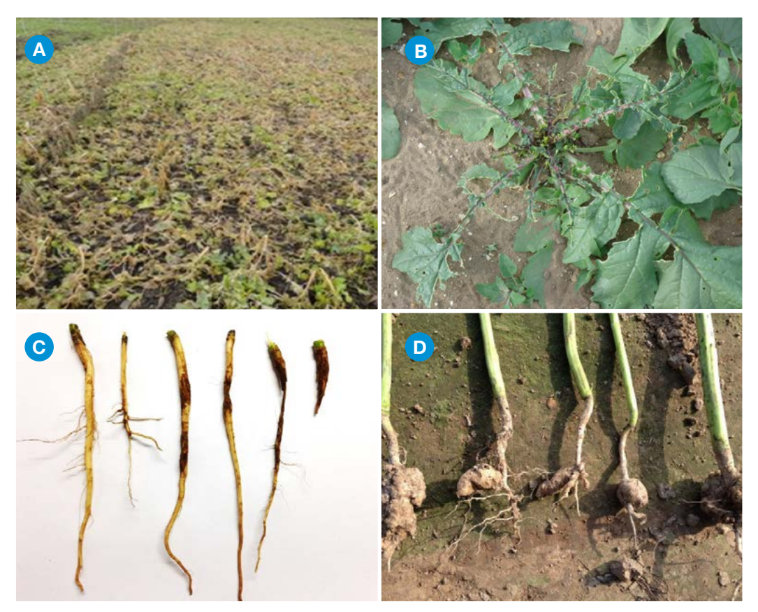
Figure 6. Biofumigant damage symptoms: A = frost damage in Indian mustard, B = pigeon damage in oil radish, C = cabbage root fly larvae damage in Indian mustard, and D = clubroot in Indian mustard

Biofumigants are susceptible to pest damage and disease, the same as any cash crop. Avoid rotations where biofumigant crops are close to each other or to oilseed rape ( Brassica napus ). Figure 6 shows potential problems, including damage from frost, pigeons, cabbage root fly larvae and clubroot, to biofumigants. Crops can recover from pigeon feeding, but it delays biomass production, enables weeds to compete and causes early senescence. Biofumigant crops can increase the risk of introducing clubroot to oilseed rape or vegetable brassicas. Request information from seed suppliers on varietal resistance to clubroot. Some oil radish varieties are resistant, but most mustards and rocket are not.