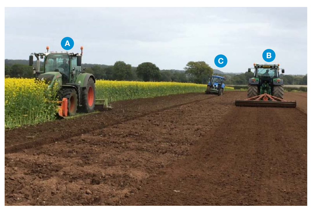
Figure 5. Multiple-pass biofumigation system: tractor A flail topping and shallow rotavating, followed by tractor B ploughing to 30 cm, followed by tractor C power-harrowing with packer-roll. The two implements on tractor A achieve full maceration and partial incorporation, allowing a short gap before tractor B fully incorporates and tractor C seals