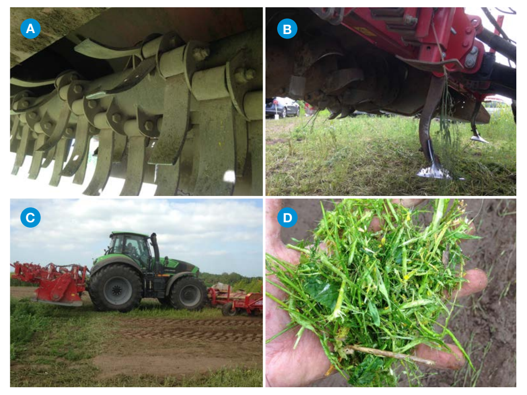
Figure 4. Single-pass biofumigation system: A = tine arrangement on a haulm topper, B = rotavator with rigid tines and S-blades, C = a single-pass system using front-mounted haulm topper and rear-mounted rotavator, and <math>D = good-quality brassica residues following maceration